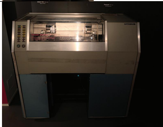
Radskrivare Datasaab 1960-70-tal