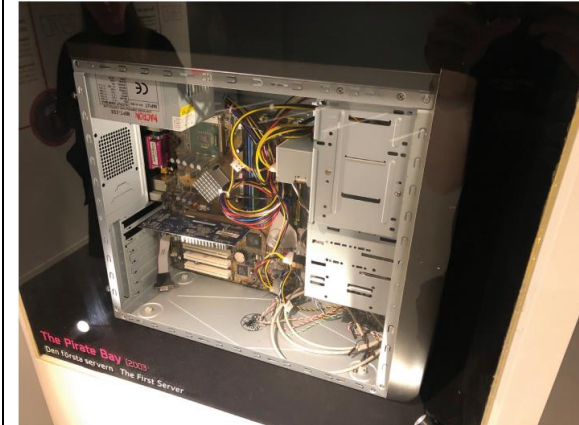
Pirate Bay-server, 2003