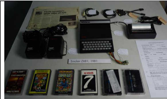
Sinclair ZX81, 1981+ program