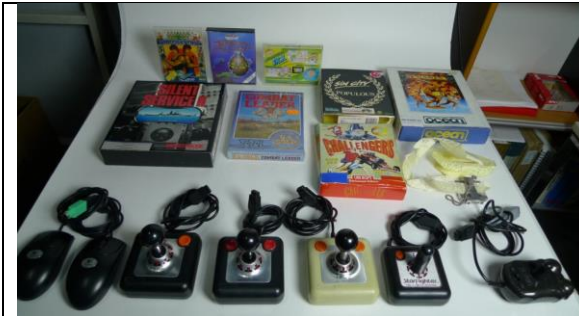
Spel + Joysticks