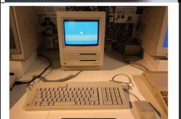
Apple Macintosh, 1987