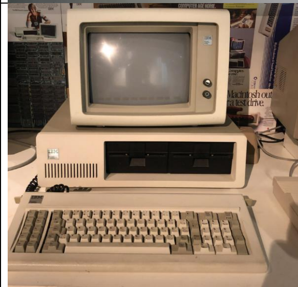
Commodore 64, 1982