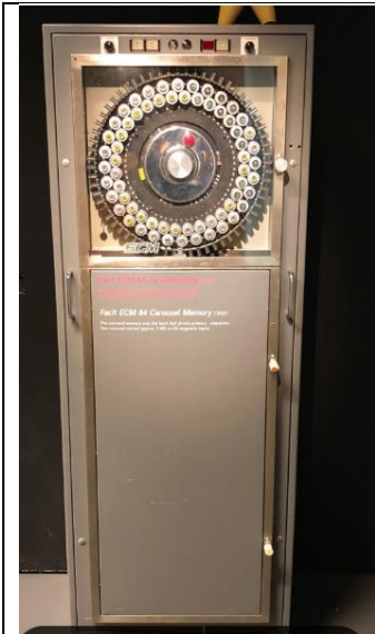
Karusellminne Facit 1958