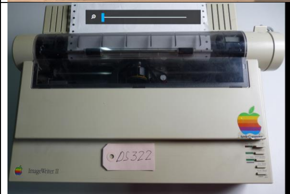
Apple Imagewriter II, 1986